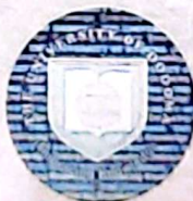
Deputy Vice Chancellor Academic, Research & Consultancy