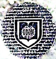
Deputy Vice Chancellor Academic, Research & Consultancy