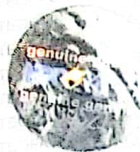
Chief Executive Officer Tanzania Institute of Accountancy